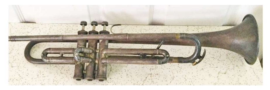
Similar Cavalier 46B design #34518 c.1939 (Horn-u-copia.net).