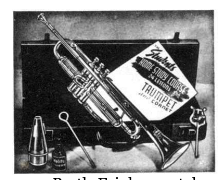
1941 Barth-Feinberg catalog Musketeer trumpet