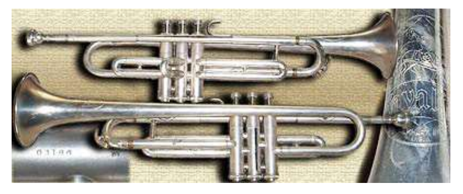
Musketeer Maestro #52xxx c.1940 (auction photo)