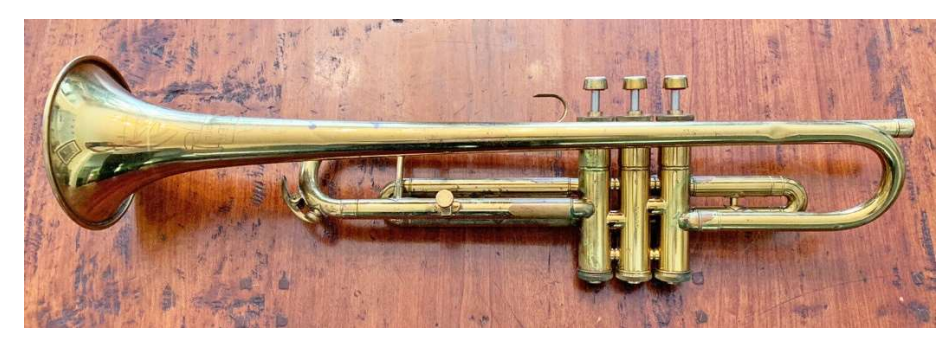
Musketeer Maestro #42959 c.1939