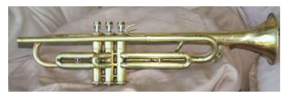
"Made in Elkhart" #53509 c.1940 (auction photo).